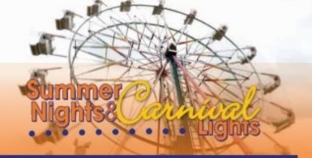
Exhibit Judging, Magic Shows, Pony Rides, AG Adventureland, Woman's Day, Parking