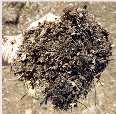
Shredded Leaf Mulch