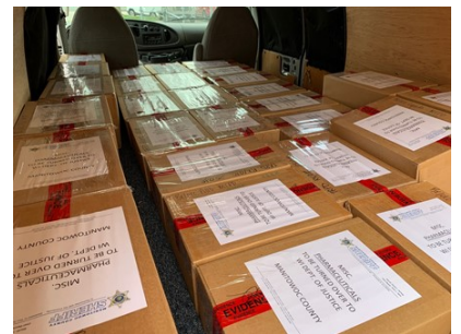
Metro Drug Unit transporting collected medications to disposal site.