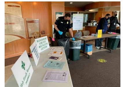
First temporary Drug Collection event at a hospital.